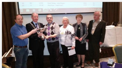
Inter A Winners