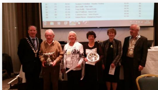
Congress Pairs Winners

For the record, the results were as follows: