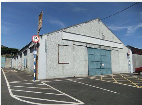
Proposed ABCD Bridge Club

Due to the age profile, it was necessary to source a property on a single floor, with adequate parking and facilities.